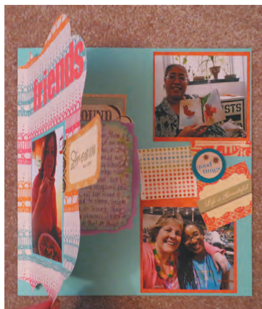
This page title is on a tag which flips open to reveal journaling behind it.