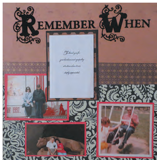
To record memories after my father's death, I wrote journaling inside a funeral thank you card. This saved ephemera and kept sensitive journaling private.

Visit Our Online Store! aCherryontop.com online store