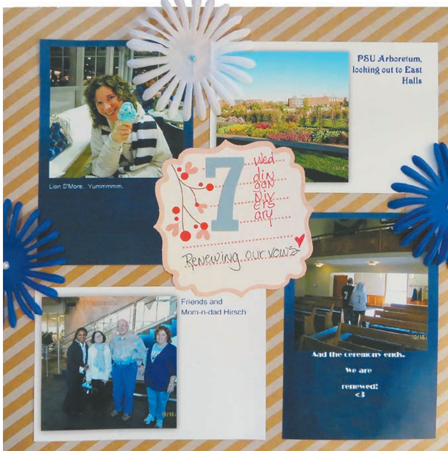
This layout was created from Facebook photos printed with the “social prints” option on a Kodak Picture Kiosk. The status is included with the image, so journaling is done.