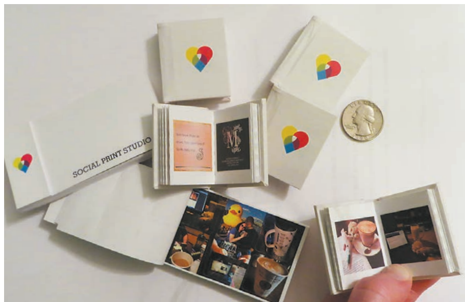
These are some of the fun, unique items that can be made from your Instagram images—mini-photobooks and stickers.

tus update, caption and hashtags directly onto a 4- by 6- inch photo. It also has the option to print in other sizes such as 5 by 5 and 6 by 6 inches. These machines have the capability to access accounts and posts of your friends and followers, but this function is limited based on personal privacy settings.